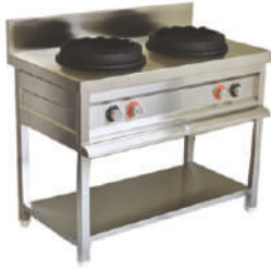
Two Burner Chinese Range