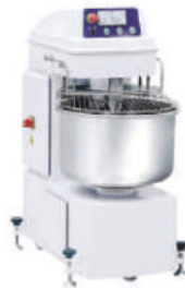
Spiral Mixer (20 to 80 Ltr)