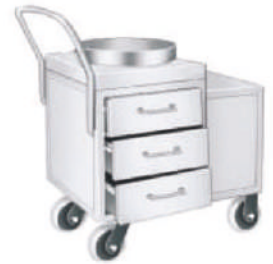
Tea Snacks Trolley