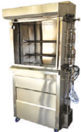
3 Rod Shawai