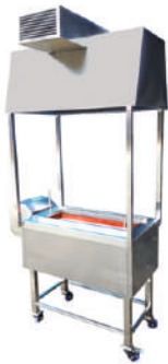
2 Grill Alfaham with hood