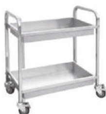
Chapati Collection Trolley