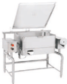
Tilting Brat Pan