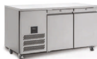
Two Door Under Counter Refrigerator