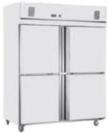
Four Door Refrigerator/Freezer