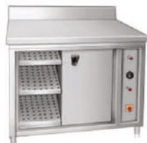
Hot Case Counter