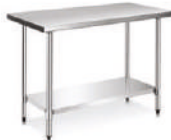
Work Table With One Shelves