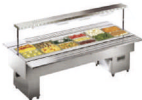
Salad Counter With Sneeze Counter