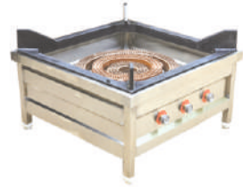
3 Ring Burner Range