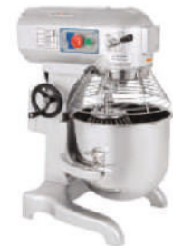
Planetary Mixer (10 to 60 Ltr)