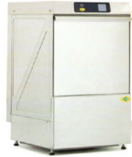
Under Counter Glass/Dish Washer