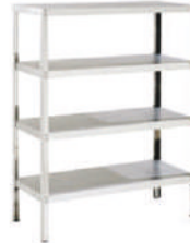
Storage Rack SS/MS