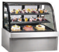
Curved Display Counter