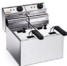
Double Deep Fryer