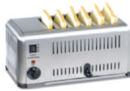
Pop Up Toaster