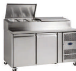
Pizza Make Line