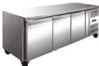
Three Door Under Counter Refrigerator