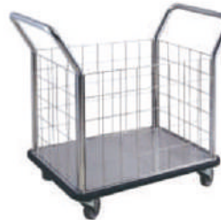
SS Linen Trolley