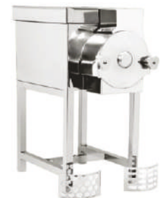
Chilli Cutting Machine