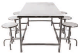
Dinning Table (4To 8 Seater)