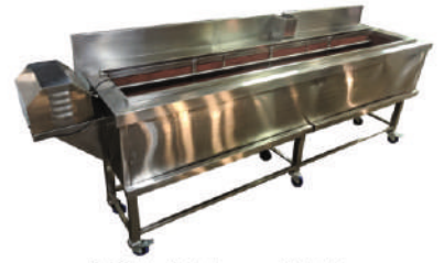
6 Grill Alfaham with blower