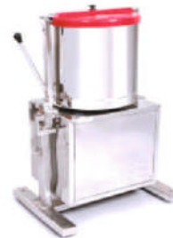
Tilting Wet Grinder