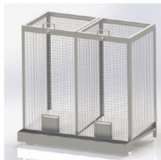
Wire Mesh Bin