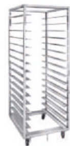
Tray Rack Trolley