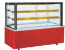
Rectangular Display Counter With Corian