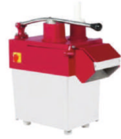
Vegetable Cutting Machine