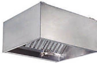
Exhaust Hood Island Type