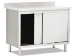
Work Table With Drawer