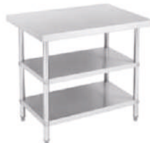
Work Table With Two Shelves