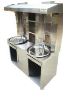
4 Burner Shawarma Unit