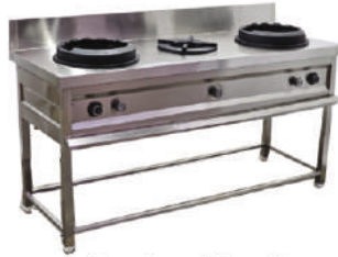
Three Burner Chinese Range