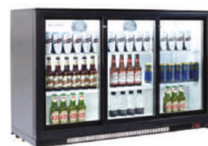
Back Bar Chiller