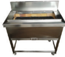
2 Grill Alfaham with blower