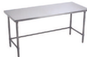
Work Table With Cross Bressing