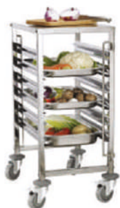
Food Pan Trolley