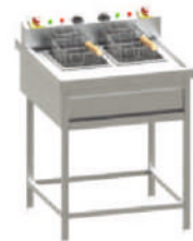
Deep Fat Fryer