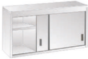
Wall Mounted Cabinet