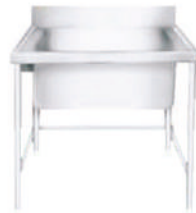
Pot Wash Sink