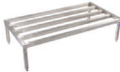
SS Dunnage Rack