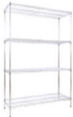
Cold Room Rack