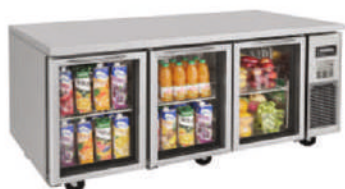
Under Counter Refrigerator