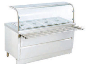
Hot Bain Marie With Sneeze Guard