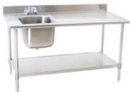
Sink With Table