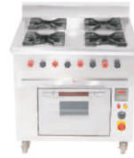
Four Burner Range With Oven