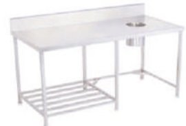
Dirty Dish Landing Table