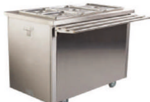
Hot Bain Marie With Tray Slide