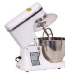
Planetary Mixer (5 To 7 Ltr)