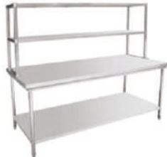
Work Table With OHS