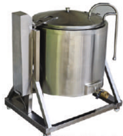
Tilting Bulk Cooker