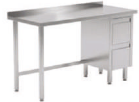
Work Table With Double Door Cabinet