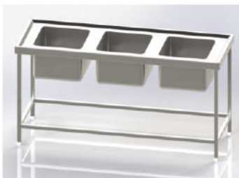
3 Sink Washing Unit