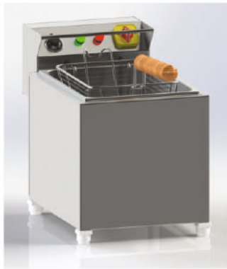
Table Top Fryer