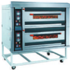
Double Deck Oven