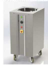
Hot Plate Dispenser