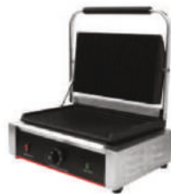
Sandwich Griller Single