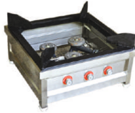
3 in 1 Bulk Range