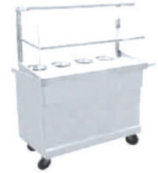
Gol Gappa Counter