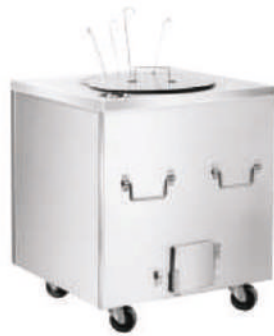
SS Tandoor Charcoal / Gas