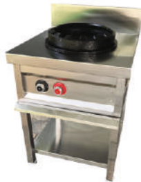
Single Burner Indian Cooking Range