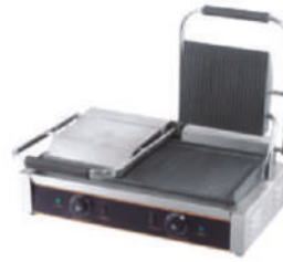
Sandwich Griller Double