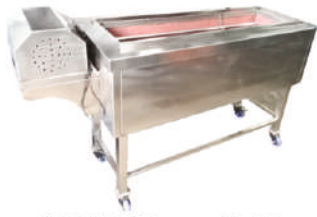
3 Grill Alfaham with blower