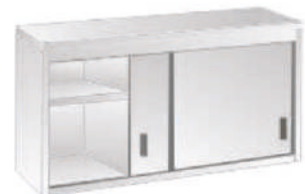
Wall Mounted Cabinet