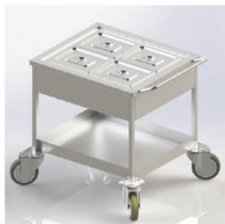
Food Servicing Trolley