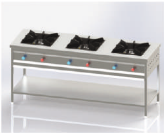
Three Burner Indian Cooking Range