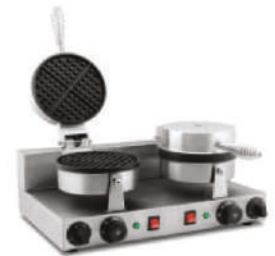
Waffle Machine Double