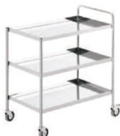
Room Service Trolley