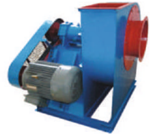
Centrifugal Blower Unit