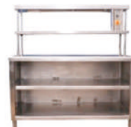
Pick Up Counter With Food Warmer