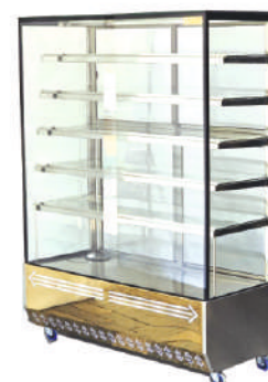
Display Glass Counter