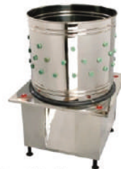
Chicken Feather Removal Machine