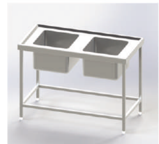
2 Sink Washing Unit