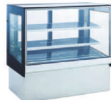
Rectangular Display Counter