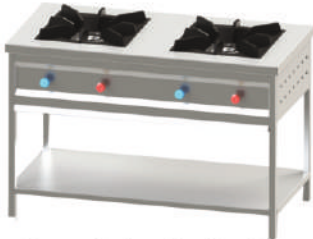
Two Burner Indian Cooking Range