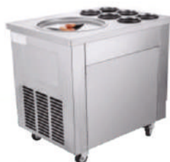
Fried Ice Cream Machine