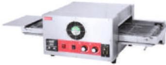
Conveyor Pizza Oven