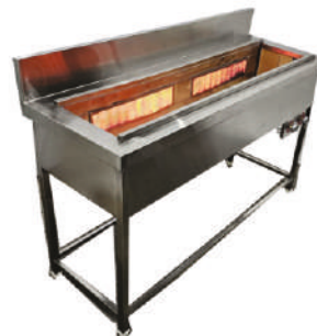
Three Grill Alfahm