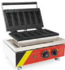
Stick Waffle Machine