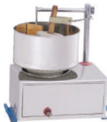
Wet Masala Grinder